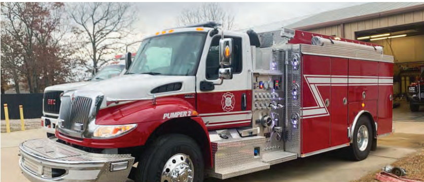
New fire pumper at White Bluff-Rye Hill Volunteer Fire Department

American Red Cross; provided over $155,000 from Casey's and their generous guests for disaster relief after tornadoes devastated Arkansas, Illinois, Indiana, Kentucky, Missouri and Tennessee.