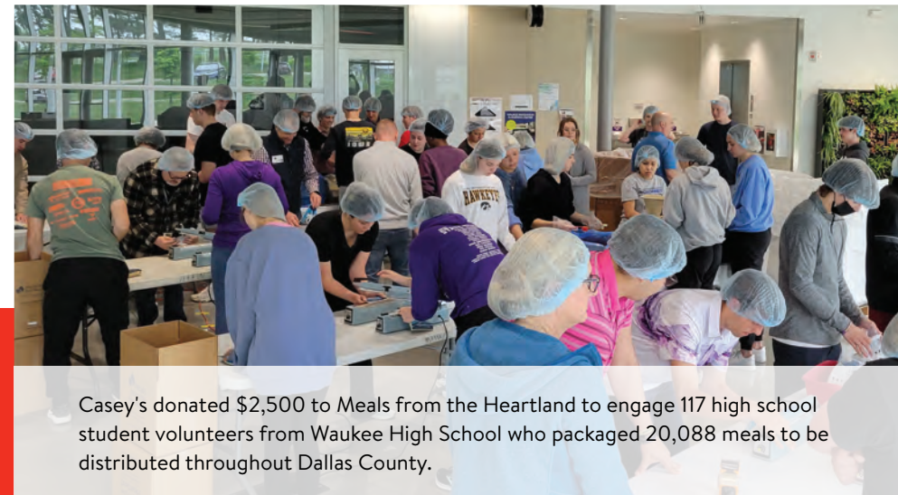
Casey's donated $2,500 to Meals from the Heartland to engage 117 high school student volunteers from Waukee High School who packaged 20,088 meals to be distributed throughout Dallas County.