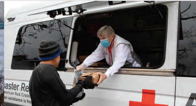
American Red Cross Disaster Relief